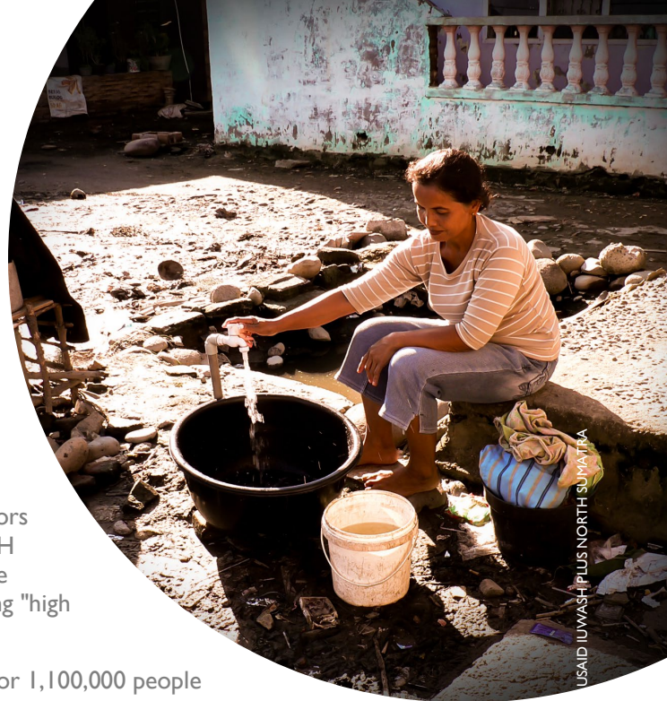
USAID IUWASH PLUS NORTH SUMATRA

In North Sumatra, USAID IUWASH PLUS works in five cities/districts located in Medan city, Deli Serdang district, Tebing Tinggi city, Pematangsiantar city and Sibolga city.